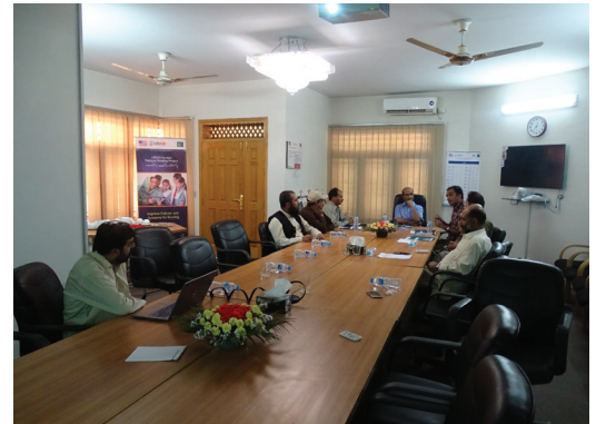
Secretary Education chairing the Meeting with Regional Staff at Regional Office Quetta.

In Balochistan Monthly/Quarterly TIG Meetings were conducted, providing support visits to schools, Reading Learning material distribution and conducting Quarterly Review Meetings in the three cohorts. In addition, its regular follow up and coordination continued with schools and education department. The provincial and district teams also actively participated in the way forward workshop with senior management in the post EGRA scenario. IRM also successfully organized a 3-day CPD workshop for cohort-1 & 2 District staff. Moreover, Secretary Secondary education visited Balochistan regional office and held meeting with staff where he has been briefed about the project goals and objectives and PRP interventions in 17 districts of Balochistan. In the meeting the secretary Education advised that regional office Balochistan will arrange meeting of all the respective District Education Officers (DEOs) of the targeted districts here in Quetta with Secretary Education where they will share progress, issues and challenges regarding project implementation in their respective districts. IRM Team in FATA organized professional development training for primary school teachers (particularly Grade-I teachers) in four districts of FATA (including Khyber, Kurram, Orakzai and FR D.I.Khan). A total number of 920 teachers (625 male and 295 female) were trained on new teaching techniques / methodologies and utilization of intensive reading material introduced by the IRM-PRP in FATA.