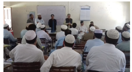
Assistant Director Education, FATA Secretariat addressing the training participants in District Kurram, FATA.

IRM has opened its International office at 29 Lincoln Inn's Field Holborn, London, its first board meeting was held on 15 May, 2018.